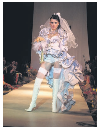
Prize of audience sympathy "High voltage "