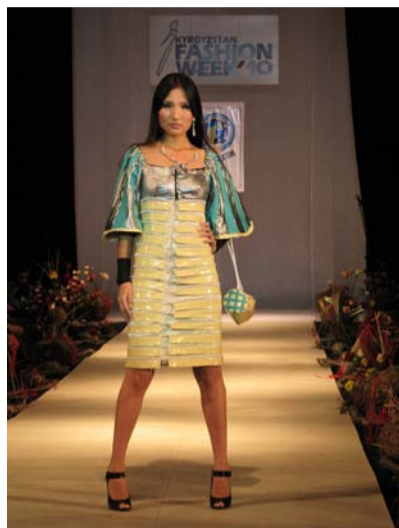
New vision "High Tek"