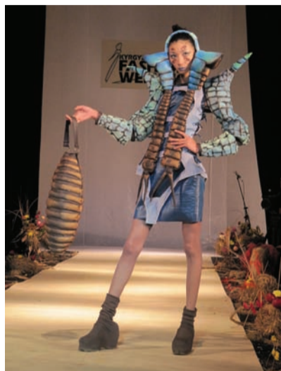
Avant guard "Reptile's evolution"