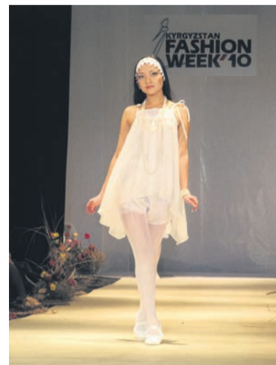
"Cherry orchard" By ZuchraMugambetova