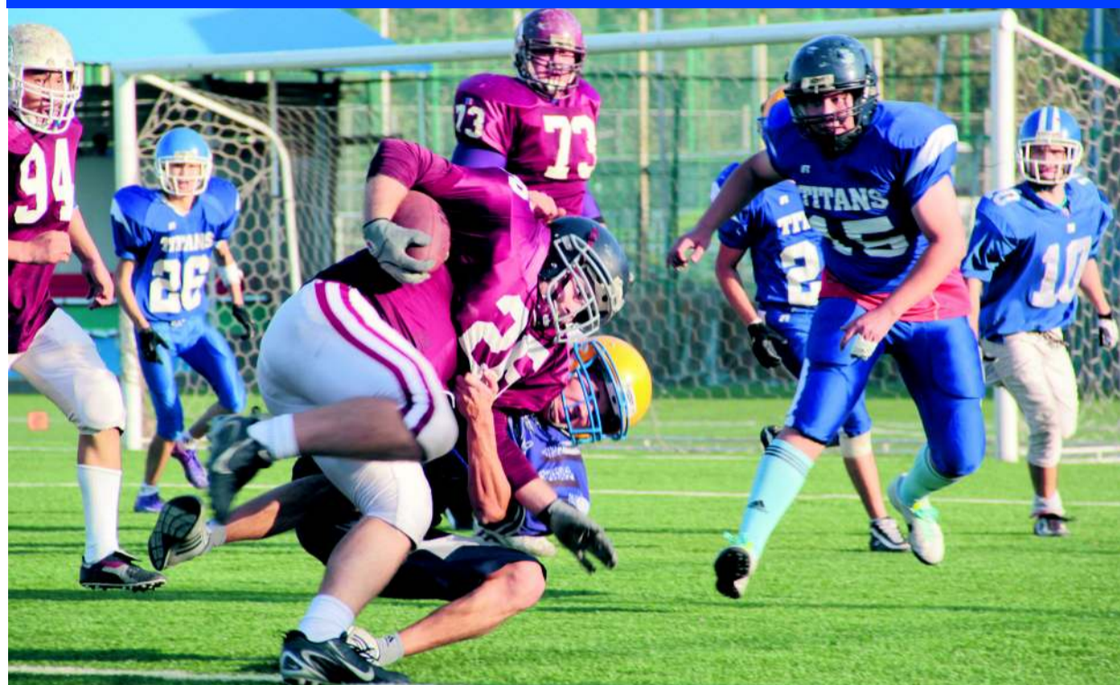
American Football p.4