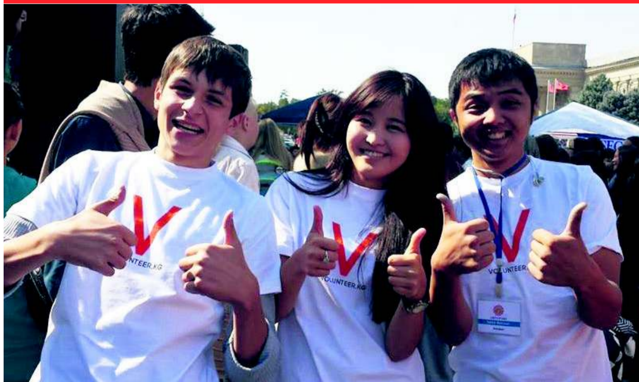
Volunteer Festival p.5