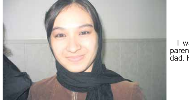
I want to thank my